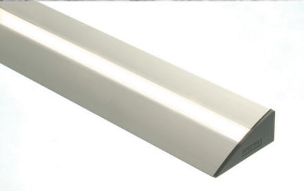
Shard 30 with dot-free linear COB light engine