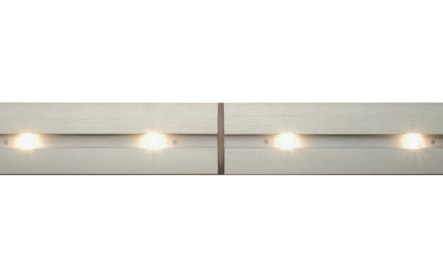
Constant LED pitch across modules