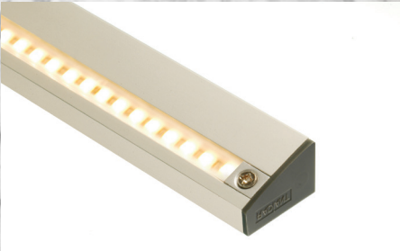
Shard with 75 mm pitch 1.2 W LEDs